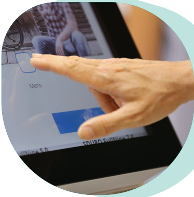
Edge-to-edge, bezel free, hardened 4 mm (plexi)glass