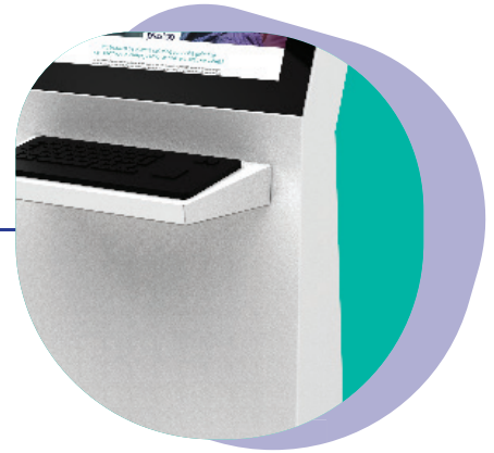
Available in different colors