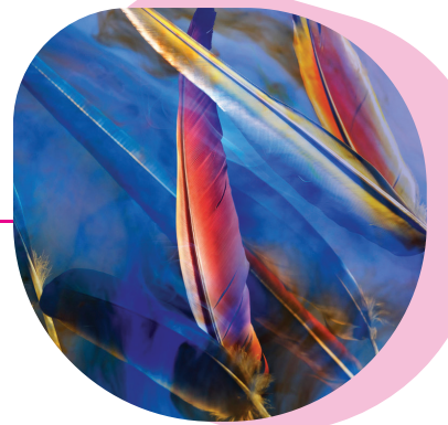
high contrast display with 10 simultane touch points