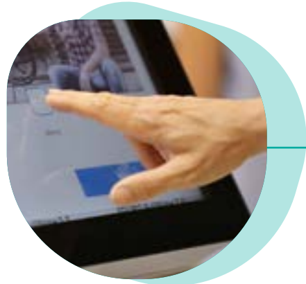
Edge-to-edge, bezel free, hardened 4 mm glass