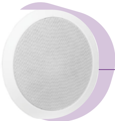
Optional build-in speakers